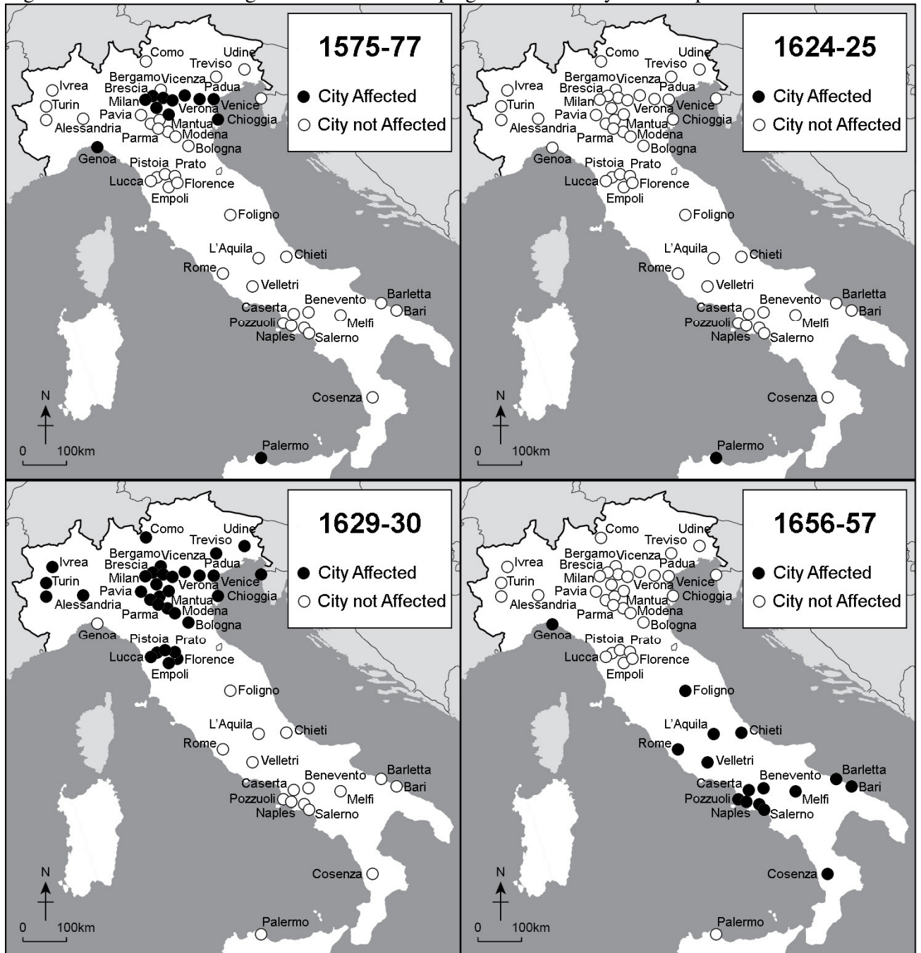
Figure 1: Territorial coverage of the main Italian plagues of the Early Modern period