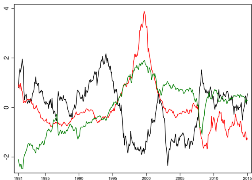
Figure 2. We plot the standardized values of expected long-term growth in earnings, 5-year return and price-to-dividend ratio ( LTG_t in red, \sum_{j=1}^5 \alpha^{j-1} r_{t+j} in black, pd_t in green, respectively). The sample period is 12/1981 to 12/2015.

We next assess two questions. First, does the predictive power of LTG actually reflect non-rational market beliefs? Second, how does it compare to stock return predictors studied in previous work? As a first step, Figure 2 graphs LTG and the price dividend ratio together with realized stock returns in the coming five years.